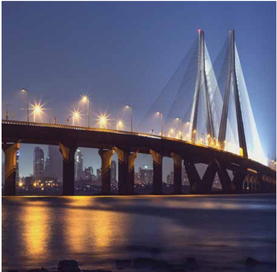
Bandra-Worli Sea Link OMT project

DURING THE YEAR UNDER REVIEW, 10,237 KILOMETRES HIGHWAYS WERE CONSTRUCTED, WHICH TRANSLATES INTO THE CONSTRUCTION OF NEARLY 28 KILOMETRES PER DAY. IN FY2019-20, NHAI ACCOMPLISHED THE HIGHEST-EVER HIGHWAY CONSTRUCTION OF 3,979 KILOMETRES SINCE ITS INCEPTION.